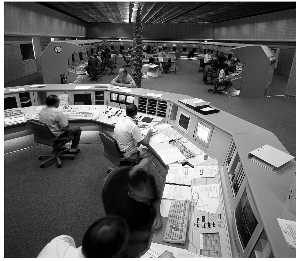
Figure 1: Langen Control Center, Langen, Germany

been able to make key strategic decisions that would have been politically difficult when DFS was under government control.