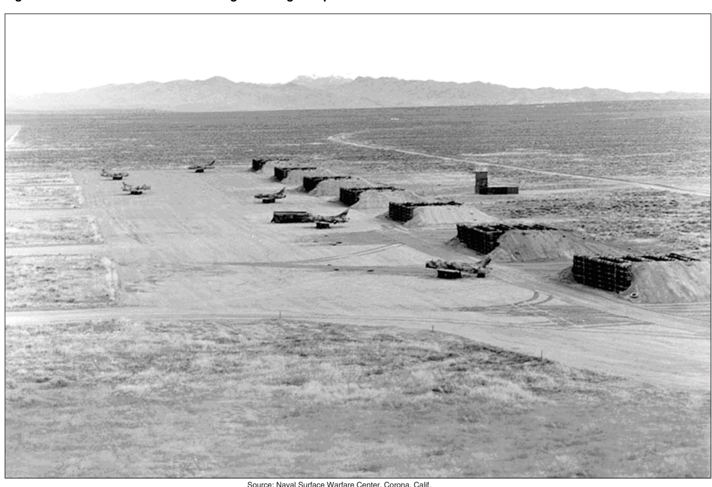
Figure 6: Mock Airfield at the Fallon Range Training Complex