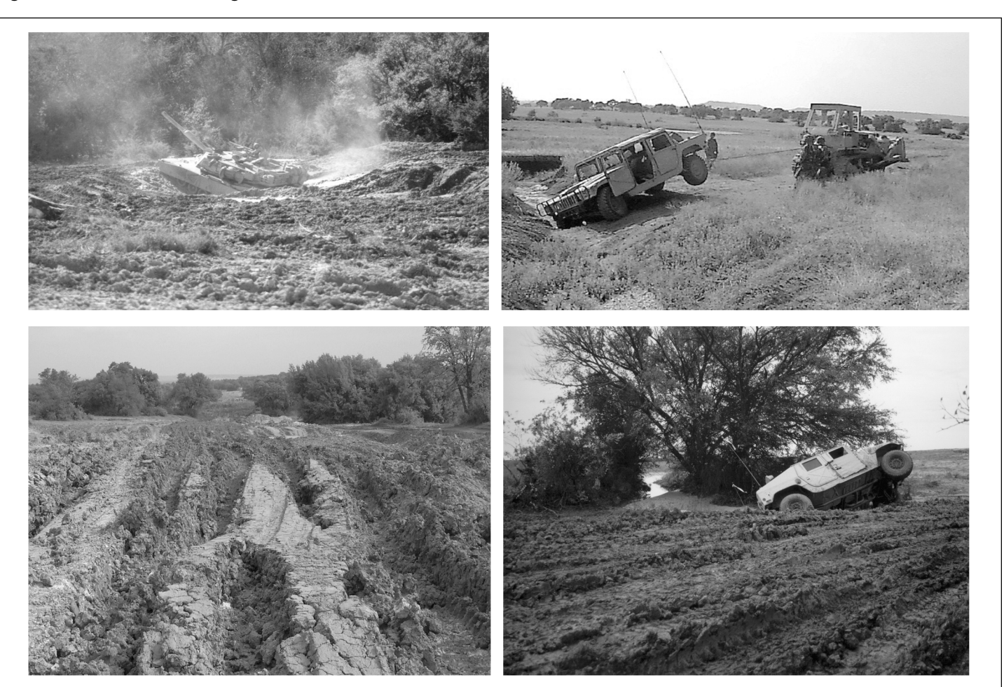
Figure 1: Deteriorated Training Areas at Fort Hood

Degraded tank trails result in training impacts and damage to military property.