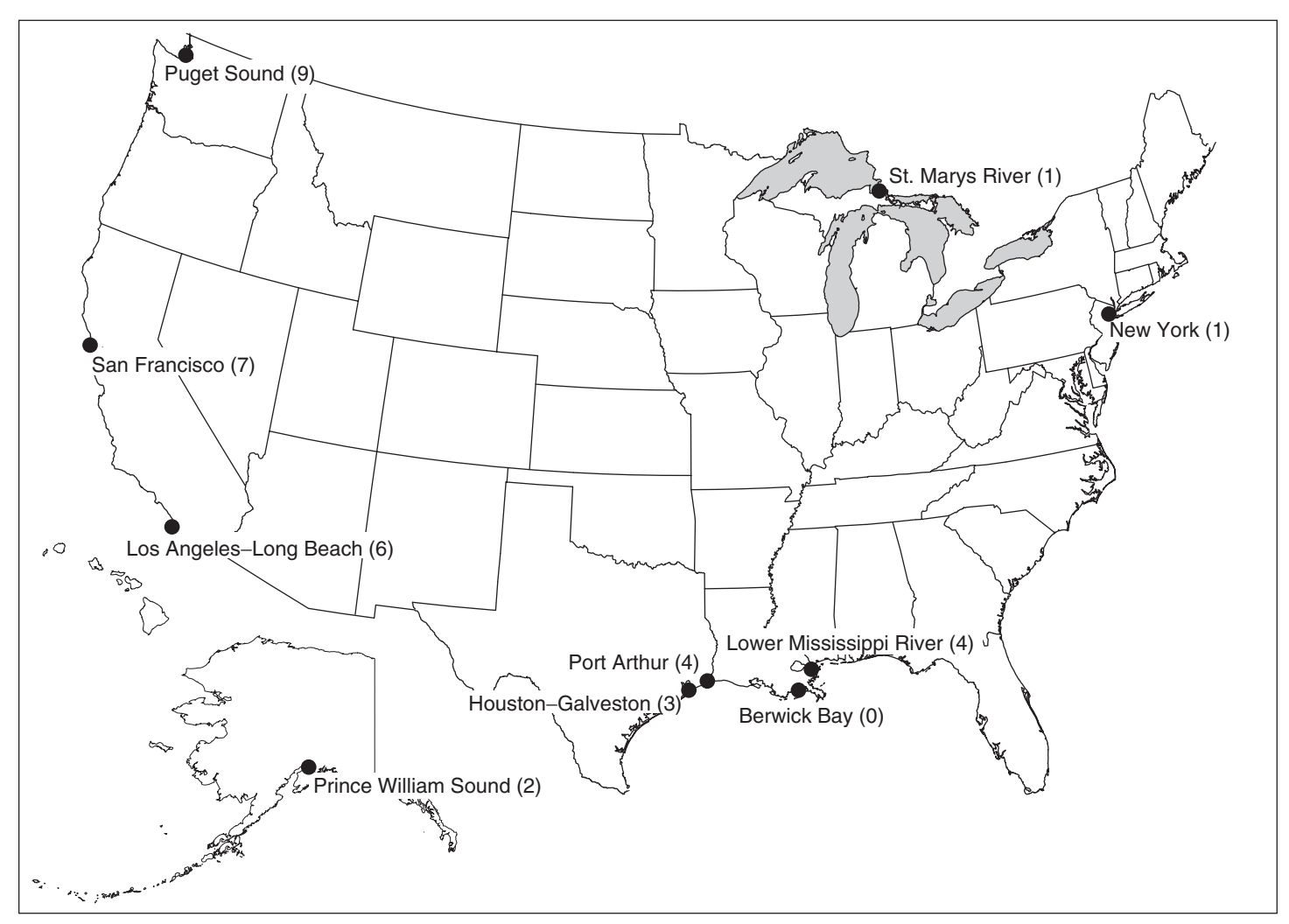
Figure 2: The 10 U.S. VTS Areas and Number of Ports within Each