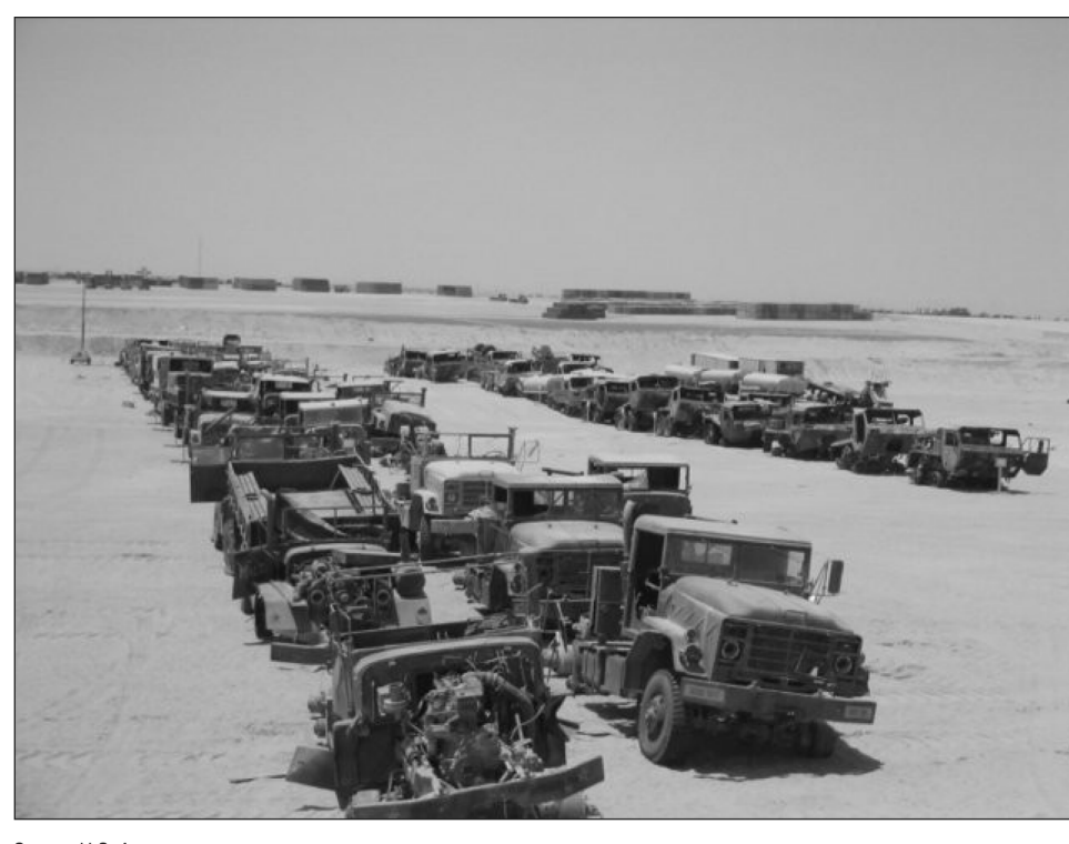
Figure 2: Some Trucks Used in OIF that Need Repair