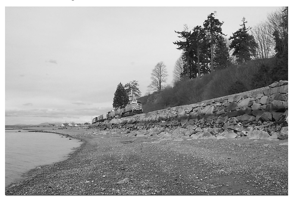
Figure 4: Photograph of a Segment of Burlington Northern Santa Fe Right-of-Way in the State of Washington

Puget Sound is on one side of the right-of-way and steep terrain is on the other side, which can be prone to mud slides. (See fig. 4.) The high level of traffic and physical constraints along this corridor have made adding passenger trains to the existing infrastructure or adding capacity difficult and, therefore, made negotiations between Sound Transit and Burlington Northern Santa Fe challenging.<sup>14</sup>