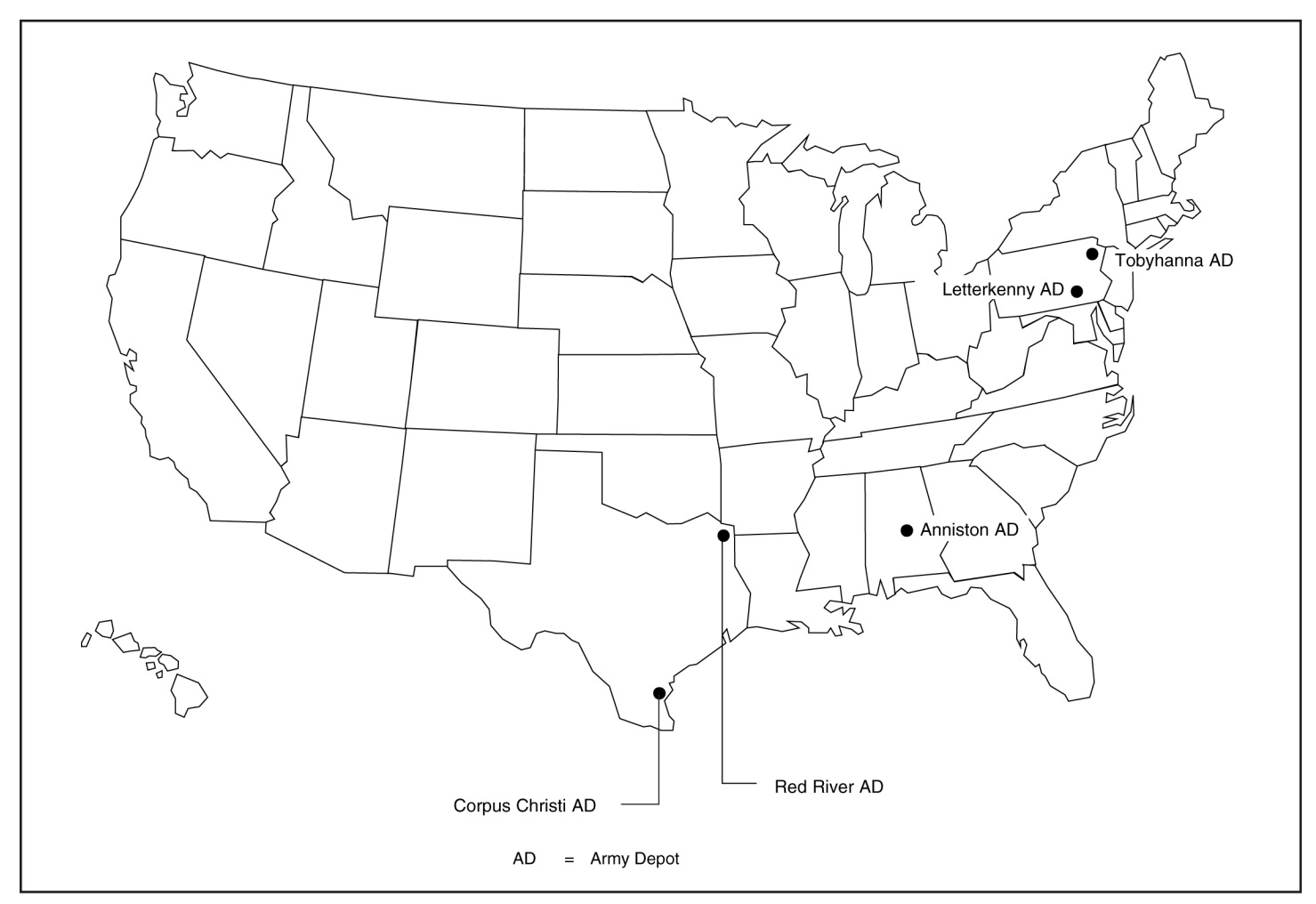
Figure 1: Location of the Five Army Maintenance Depots

transmissions, and thousands of other components.<sup>3</sup> The number of these facilities has been reduced from 10 in 1976 to the existing 5 as of June 2003, and 2 of the remaining 5 were significantly downsized and realigned as a result of implementing the 1995 Base Realignment and Closure (BRAC) decisions. Figure 1 shows the locations of the remaining five Army maintenance depots.