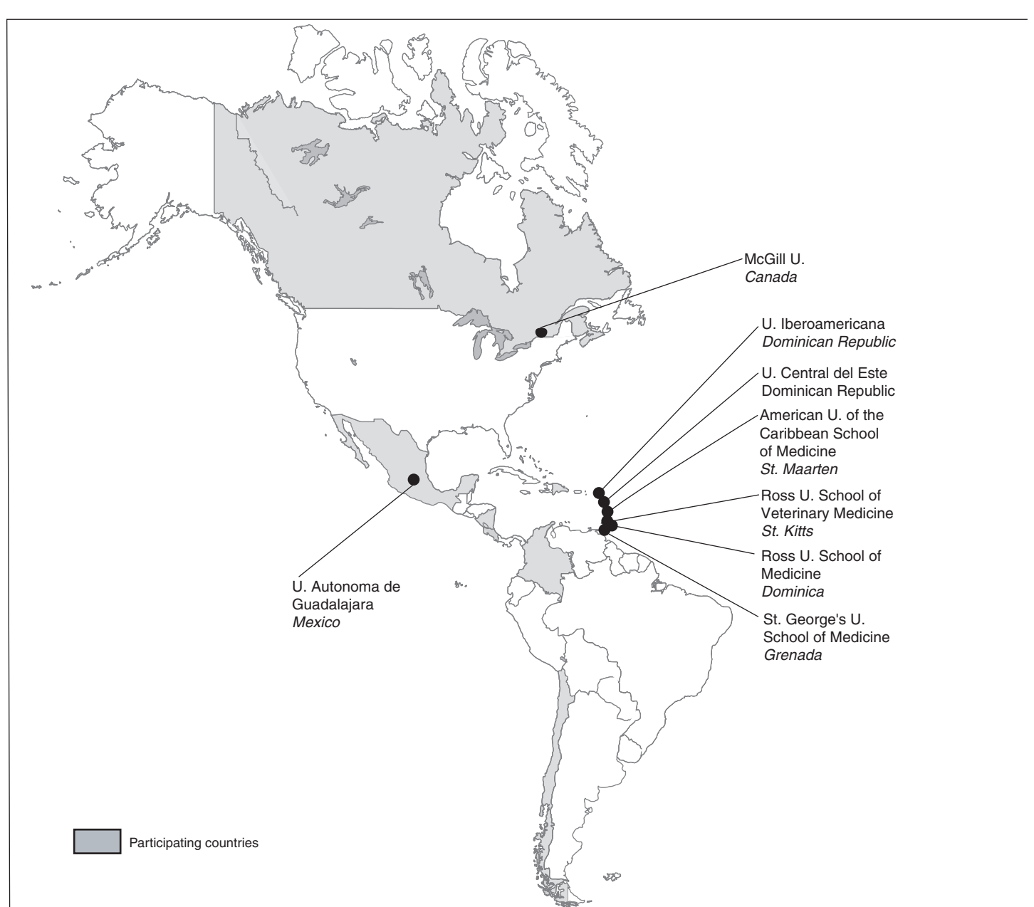
Figure 1: Countries with Schools Eligible to Participate in FFELP and Top 10 Foreign Schools by Loan Volume for Academic Year 2000-01