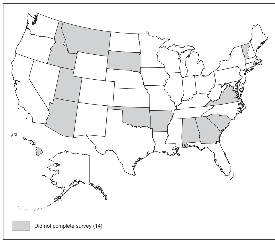
Figure 5: State Survey Respondents

In conducting our work, we administered a Web survey to the 50 states and the District of Columbia, and a separate Web survey to a nationally representative sample of 830 school districts, that included strata for high-poverty, low-poverty, rural, and urban districts. The response rate for the state survey was 71 percent and for the district survey 62 percent. The surveys were conducted between December 4, 2002, and April 4, 2003. We analyzed the survey data and identified significant results. See figure 5 for a geographic display of responding and nonresponding states.