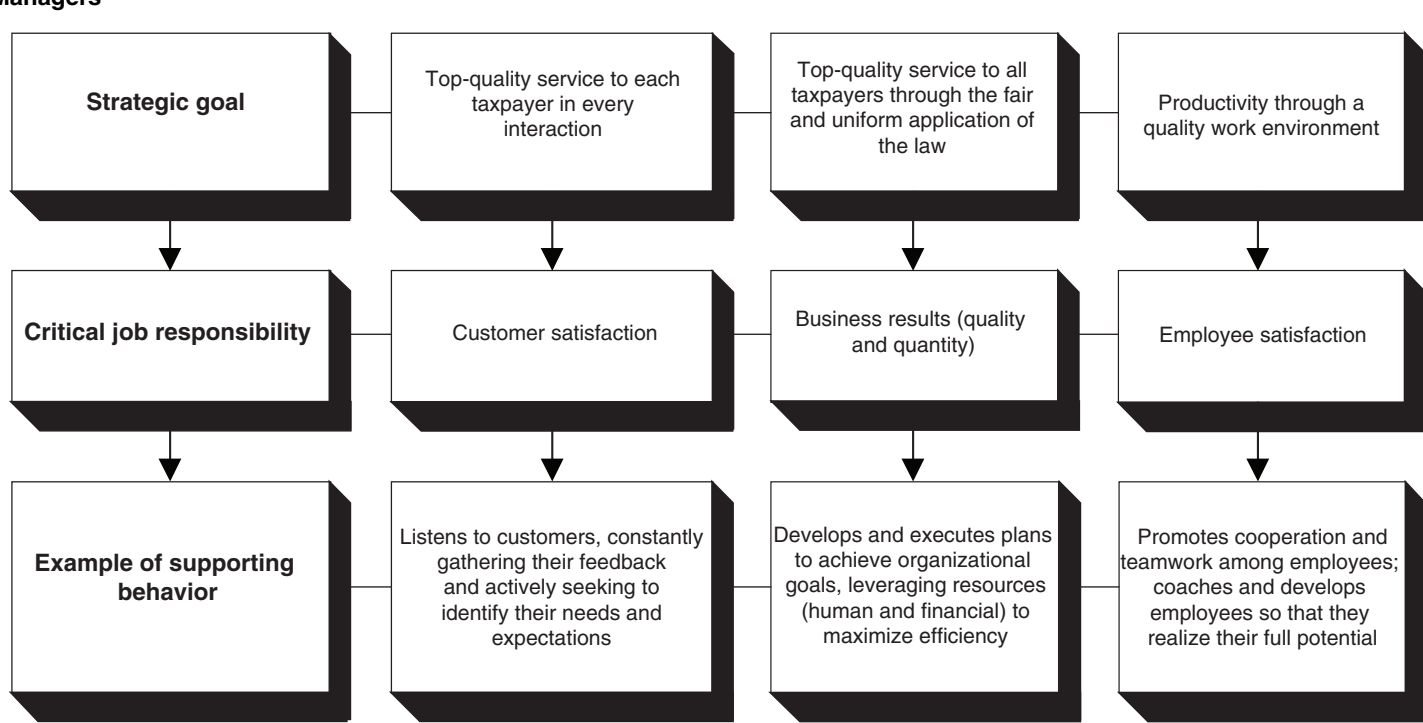
Figure 3: Alignment of Strategic Goals, Critical Job Responsibilities, and Supporting Behaviors for Enforcement Group Managers