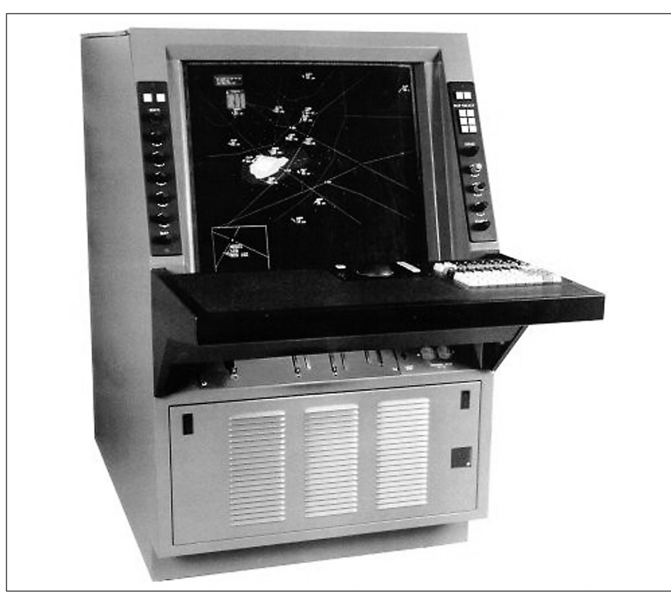
Figure 1: Standard Terminal Automation Replacement System (STARS)

operational efficiency, and improve controllers' productivity. FAA believes that STARS will facilitate efforts to optimally configure the terminal airspace around the country, exchange digital information between pilots and controllers, and introduce new position and surveillance capabilities for pilots.