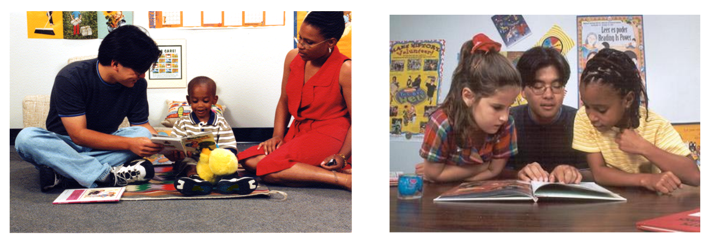
Note: Early exposure to the classroom is a recruitment strategy used by several grantees to introduce teaching as a profession.

Figure 1: Recruitment Efforts to Attract Young People to the Field of Teaching.