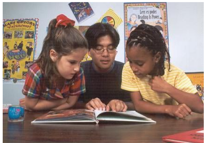
Early exposure to teaching is a recruitment strategy used by several grantees.

Education has approved or awarded 123 grants to states and partnerships totaling over $460 million dollars. Grantees have used funds for activities they believe will improve teaching in their locality or state, but it is too early to determine the grants' effects on the quality of teaching in the classroom. While the law allows many activities to be funded under broad program goals outlined in the legislation, most grantees have focused their efforts on reforming requirements for teachers, providing professional development to current teachers, and recruiting new teachers. However, within these general areas, grantees' efforts vary.