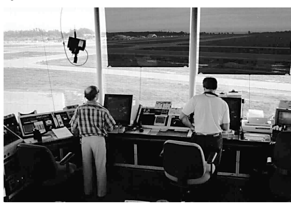
Figure 2: Air Traffic Controllers in a Tower

aircraft hands off responsibility for them to the controller directing departures from the airport. As departing aircraft near the end of the tower's airspace, controllers transfer control of the plane to a controller at a TRACON who, in turn, transfers the aircraft to an en route center as it leaves the TRACON's airspace.