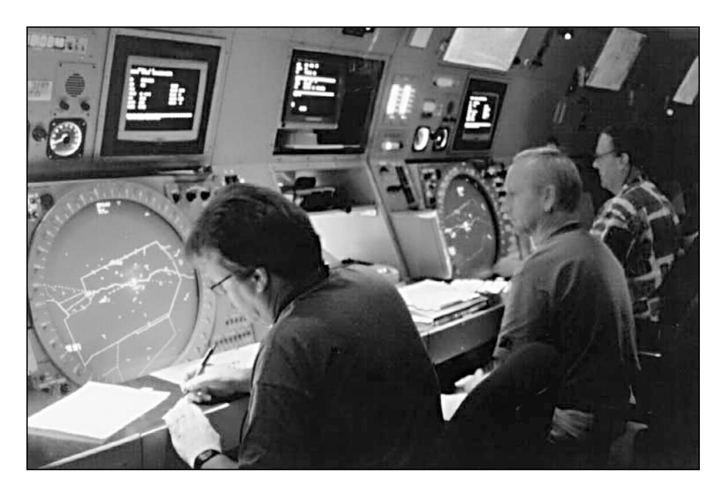
Figure 3: Air Traffic Controllers in a TRACON