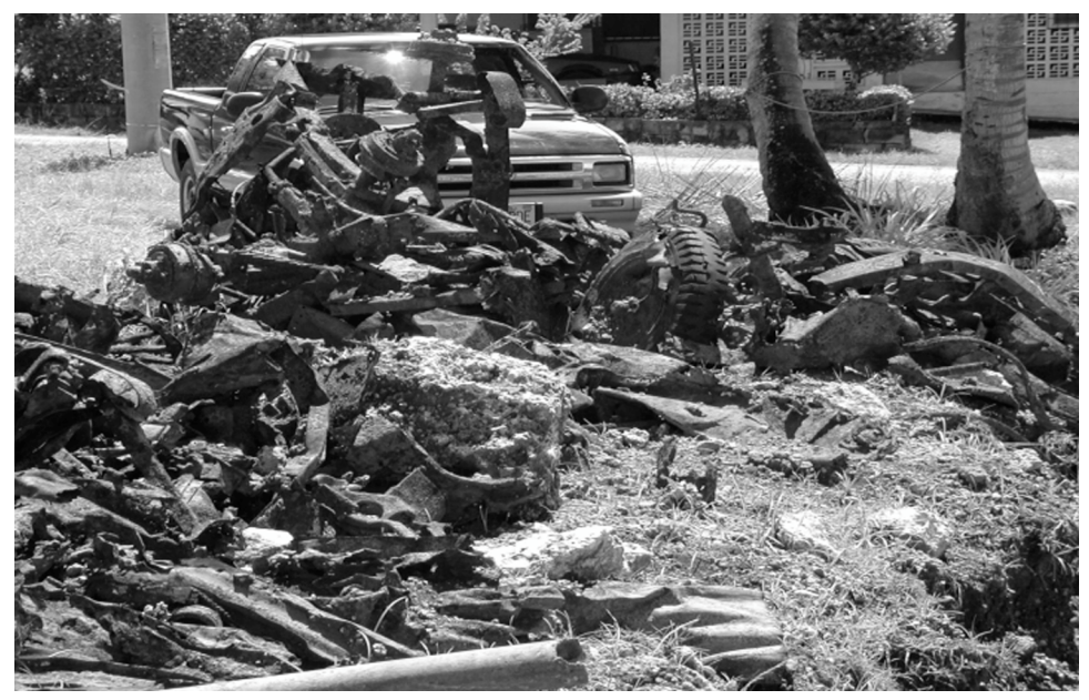
Figure 2: DOD Debris Unearthed While Excavating Private Property in Guam