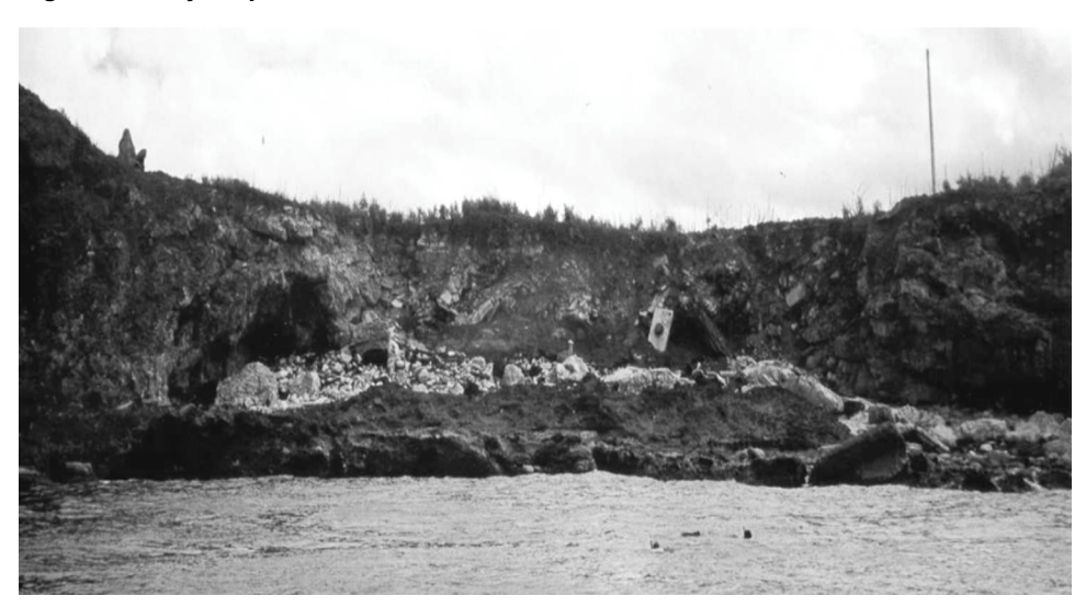
Figure 1: Navy Disposal Site at Orote Point Before Restoration