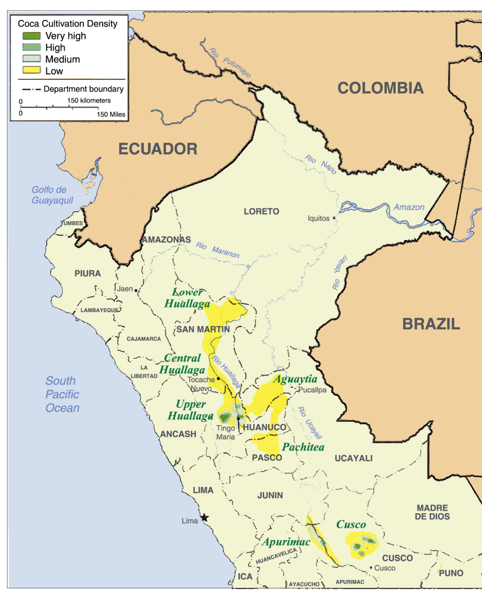
Figure 3: Illicit Drug-Growing Areas in Peru