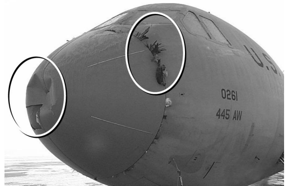
Cargo 141 damage and bird remains from collision with a Canada goose.