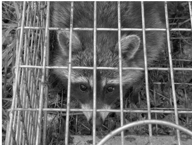
A raccoon is trapped for testing as part of the program's rabies control work in Ohio.