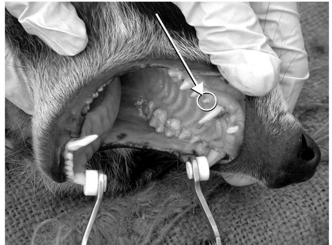
The first pre-molar is pulled and tested for tetracycline (indicating consumption of rabies vaccine bait).