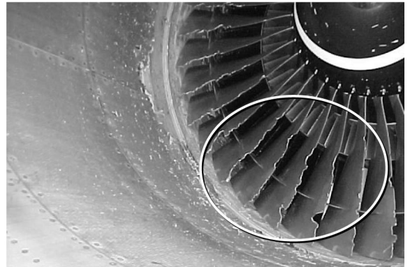
Boeing 747 fan blade damage from collision with a Western gull.