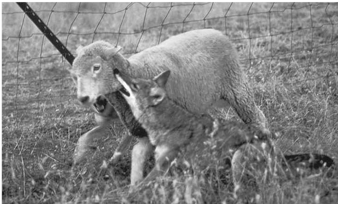
Two coyotes attacking a lamb.