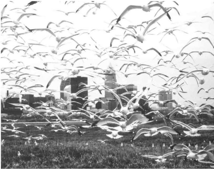
Gulls are involved in nearly one-third of all reported collisions.