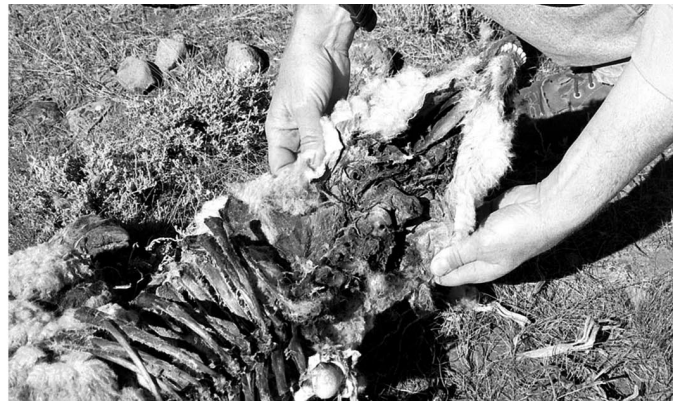
Wildlife Services officials can tell that this lamb was killed by a coyote.

Sources: Coyotes attacking lamb, USDA; lamb carcass, GAO.