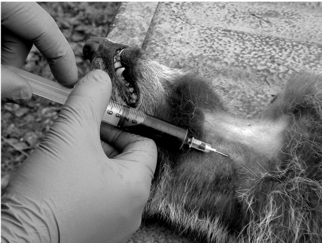
Blood is drawn and tested for rabies antibodies.