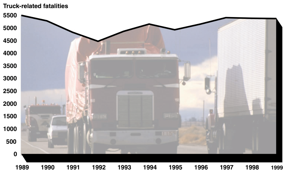
Figure 1: Number of Fatalities From Large Truck Crashes, 1989-1999