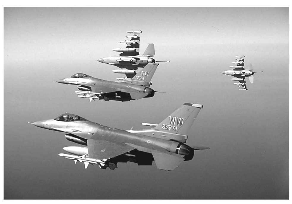
Figure 5: F-16CJ Aircraft

In 1996, we expressed concern about the decision to retire the Air Force's F-4G and EF-111 without comparable replacements. Subsequently, the services realized that the decrease in their suppression capabilities had increased U.S. aircraft vulnerability and could potentially frustrate achievement of U.S. military objectives and prolong future conflicts. Therefore, since 1996, the services have taken a number of actions to improve their suppression capabilities. First, the Air Force is increasing the size of its fleet of F-16CJ suppression aircraft (see fig. 5), and the Navy and the Marine Corps are adding EA-6B suppression aircraft to help reverse the quantitative impact of the retirement of the EF-111s and F-4Gs.