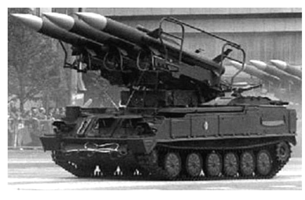
Figure 3: Mobile SA-6 Surface-to-Air Missile System