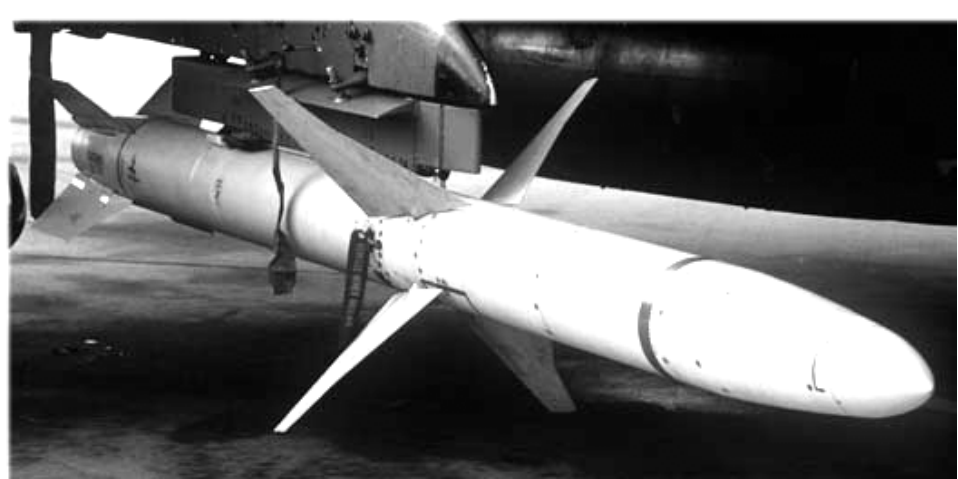
Figure 1: AGM-88 High-Speed Anti-Radiation Missile

among the first to be called in and the last to leave. Suppression aircraft such as the now retired EF-111 and F-4G played a vital role in protecting other U.S. aircraft from radar-guided missile systems during Operation Desert Storm in Iraq. In fact, Air Force strike aircraft were normally not permitted to conduct air operations unless protected by these suppression aircraft. The EF-111 was equipped with transmitters to disrupt or "jam" radar equipment used by enemy surface-to-air missile or anti-aircraft artillery systems. The F-4G used anti-radiation missiles that homed in on enemy radar systems to destroy them (see fig. 1).