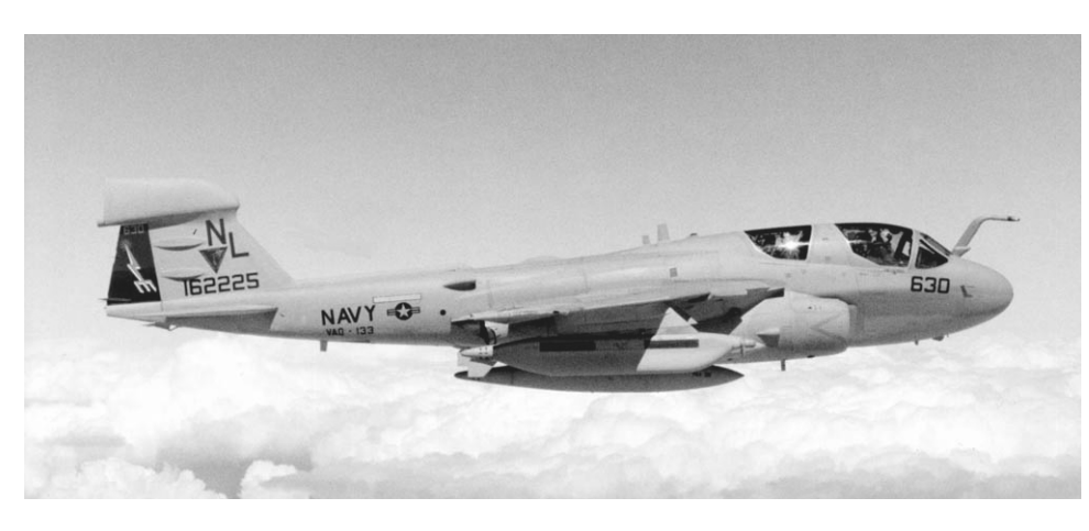
Figure 2: EA-6B Prowler