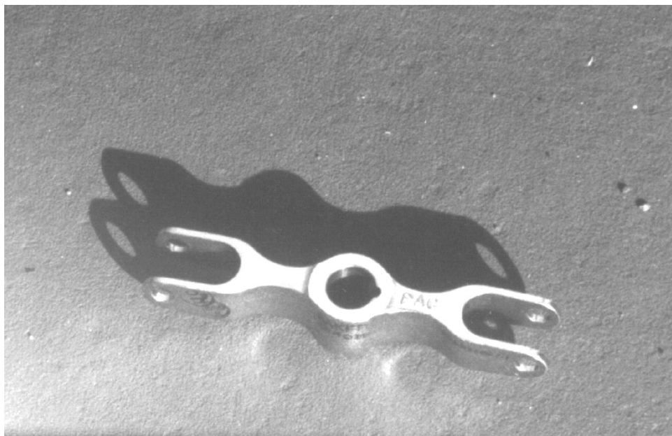
Figure 4: Tail Rotor Control Assembly

Also, in February 1998, the Kaiserslautern DRMO was offering for sale three tail rotor control assemblies used on the AH-1 Cobra helicopter (see fig. 4). If this part were to fail, the aircraft would spin uncontrollably and crash. The parts were not accompanied by required documentation stating it was safe to reuse them. DRMO officials said that they had not received any notification from the Army that this item had flight safety implications. Sales history information showed that this same part, described as being in severely worn condition, was sold in July 1996 by the DRMO in Columbus, Ohio, without any assurance that the part was safe to reuse.