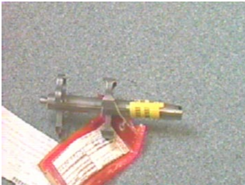
Figure 3: Ammunition Feeder for an Automatic 30-Millimeter Gun

that they still did not have adequate demilitarization instructions and, as a result, the demilitarization process is simply a trial and error process. For example, at the DRMO at Fort Hood, Texas, we noted a part used as an ammunition feeder for an automatic gun was coded for total destruction, but no specific guidance exists on how to destroy the part (see fig. 3). DRMO officials stated that their demilitarization process previously involved cutting the shaft of the feeder into two pieces. However, the officials discovered that, when the part is demilitarized in this manner, it can be welded back together and used as it was originally intended. The DRMO personnel then began cutting off all of the feeders' appendages, which rendered the part unusable.