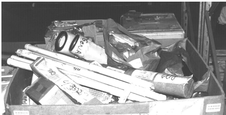
Figure 2: Batch Lot Containing Military Technology Items

In our October 1997 report, we recommended that DOD improve the accuracy of assigned demilitarization codes by providing its personnel with guidance on selecting appropriate demilitarization codes that includes the specific details necessary to make appropriate decisions. DOD agreed with our recommendation and stated that it would work with the military services and the Defense Logistics Agency to determine the feasibility of departmentwide use of a worksheet that provides personnel with the specific details necessary to make prudent decisions on selecting the appropriate demilitarization codes. However, as of May 1998, DOD had not started using a worksheet departmentwide.