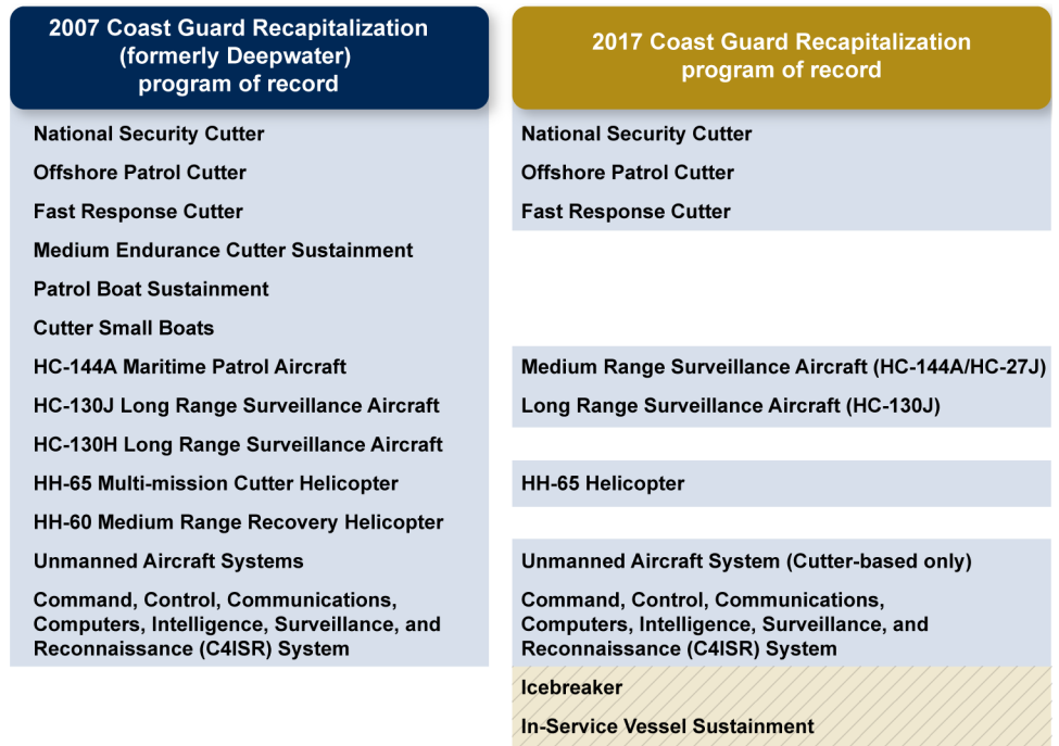
Figure 2: The Coast Guard’s 2007 and 2017 Recapitalization Efforts

Source: GAO presentation of Coast Guard information. | GAO-17-654T