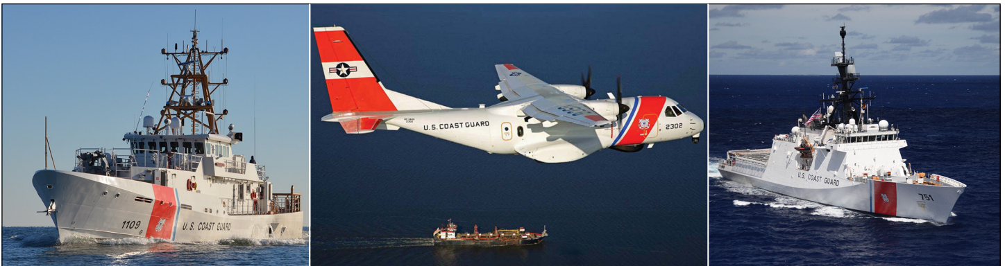
Figure 1: The Coast Guard’s National Security Cutter, HC-144A Maritime Patrol Aircraft, and Fast Response Cutter

In the 1990s, the Coast Guard began an initial effort to modernize its aging assets that would allow it to successfully meet mission demands. After the September 11, 2001 terrorist attacks, the Coast Guard became a component of the newly established Department of Homeland Security (DHS), which resulted in an increase in mission demands. 3 In order to meet this increase, the Coast Guard completed a Mission Needs Statement—the document that describes the mission(s) and needed capabilities to justify a given program—in 2005. The 2005 Mission Needs Statement compared the new assets for which the Coast Guard originally planned to procure—in 1996 prior to the creation of DHS—to replace its legacy assets to the demands of the new missions as laid out by the recently formed DHS. Based on the 2005 Mission Needs Statement, DHS approved a program of record in 2007—known as the Deepwater program—that provided the additional capability required. This effort was expected to last 25 years at a cost of $24.2 billion resulting in either the rebuilding or replacing of vessels and aircraft that were reaching the end of their expected service lives and were in deteriorating condition. Figure 1 shows some of the Coast Guard’s newer assets that are part of this broader modernization effort.