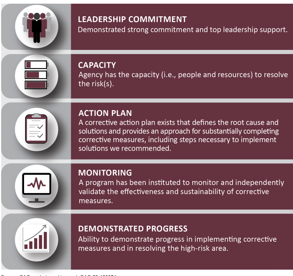
Figure 2: Criteria Essential to Addressing High-Risk Areas

Source: GAO analysis and icons. | GAO-23-106674