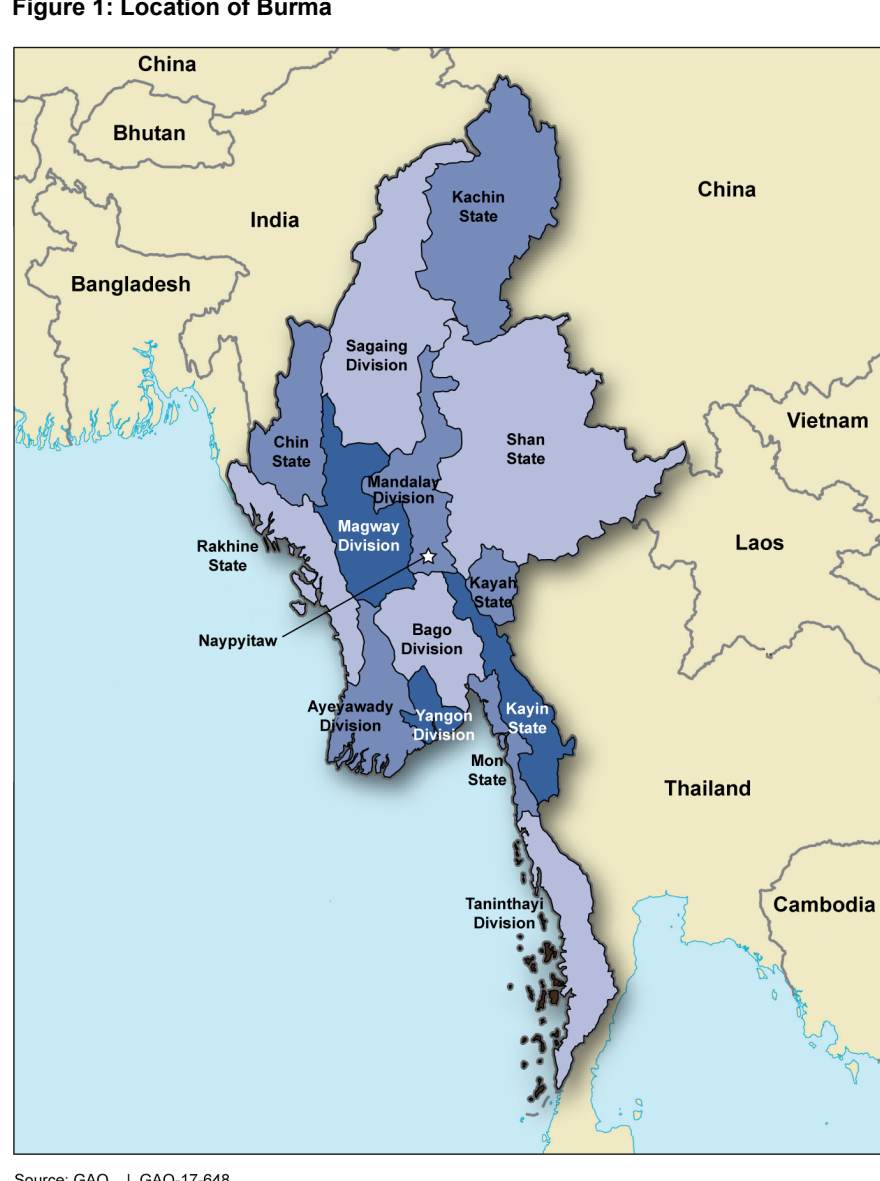
Figure 1: Location of Burma