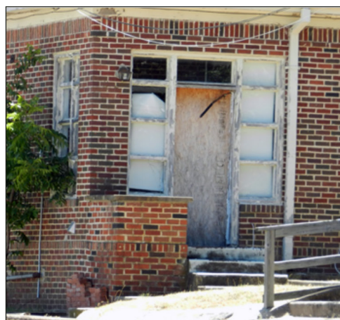
Exterior view of the building shows broken windows and missing bricks.