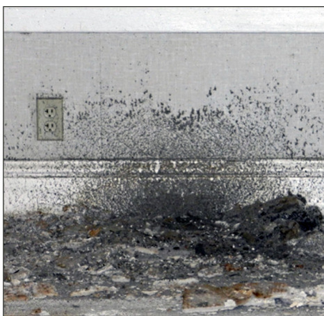
Portions of the ceiling have collapsed, spraying debris on to the floors and walls.