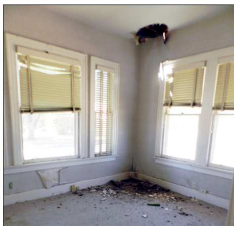
Interior damage of Kerrville Medical Center.