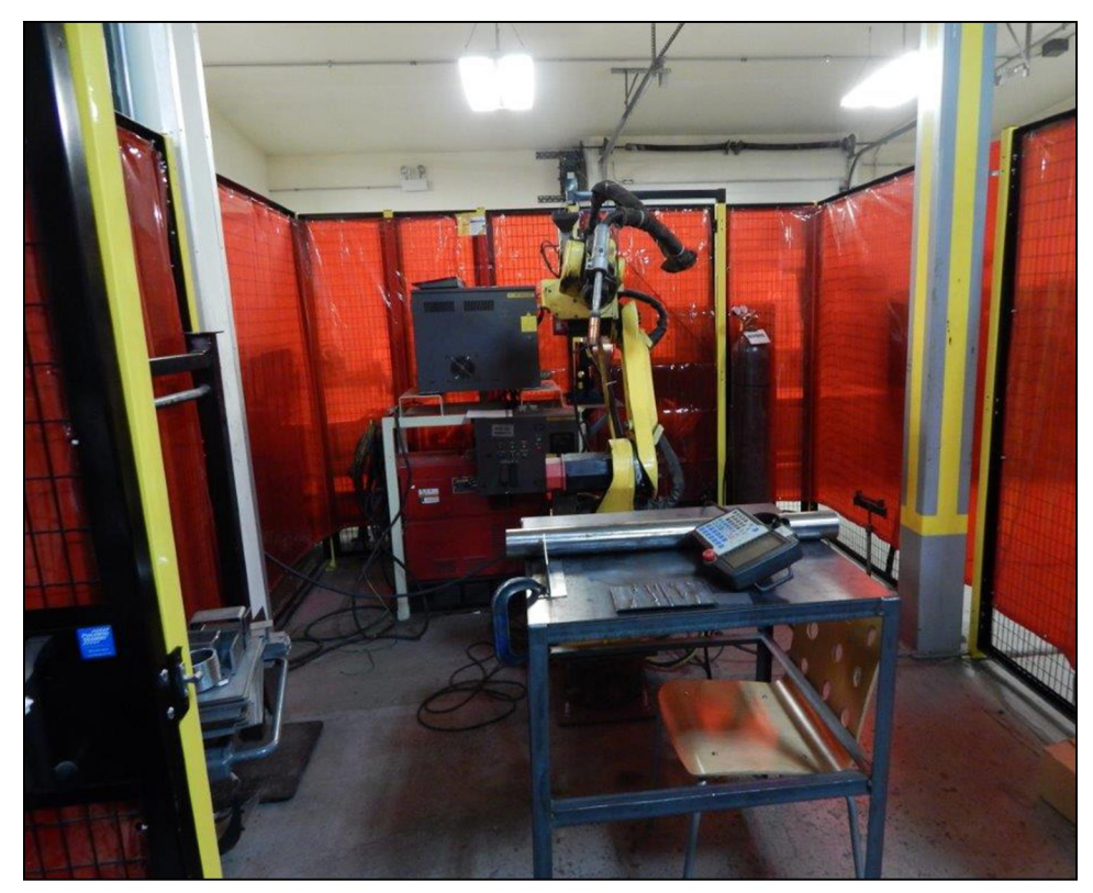
Figure 4: Welding Machine Used For Training