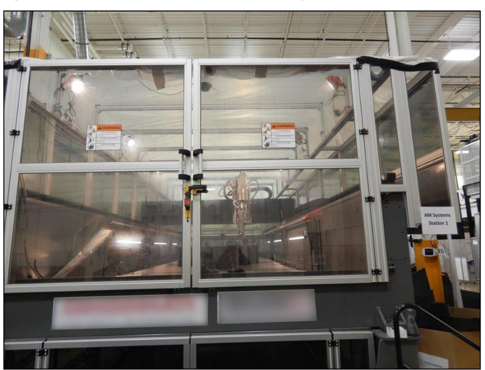
Figure 3: 3D Printer Used in Advanced Manufacturing