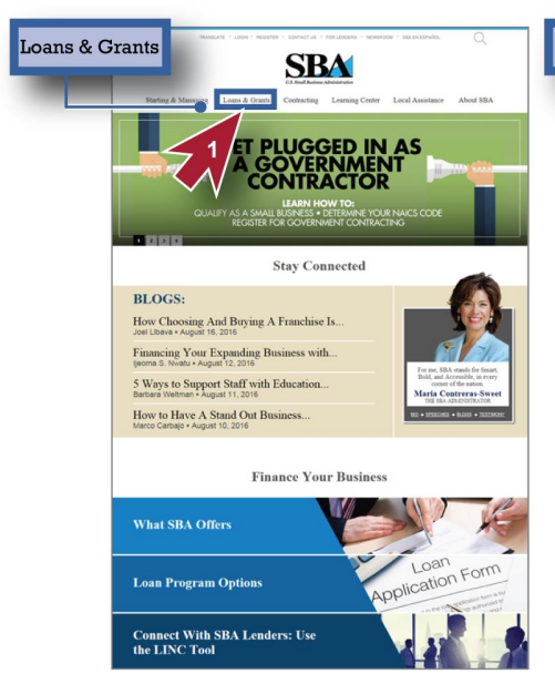
Figure 4: Navigation of Small Business Administration's Website to Access Disaster-Loan-Related Information and Resources, as of August 2016