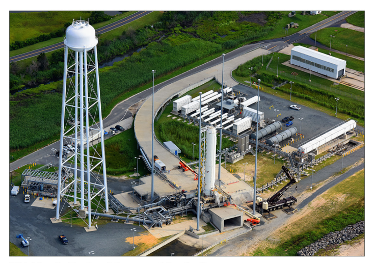
Figure 1: Vertical and Horizontal Spaceports