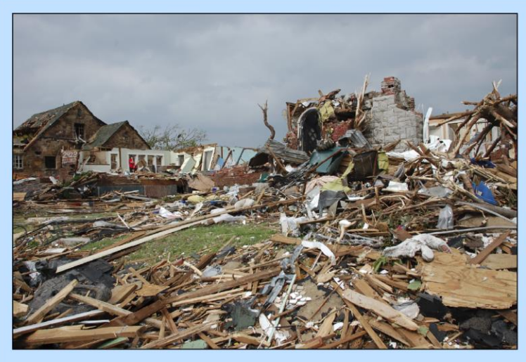
Figure 4: Property Damaged by 2011 Tornado in Joplin, Missouri

together state and local stakeholders from affected states and communities, provided training on effective recovery planning and management practices. It also created a forum for sharing lessons learned from past disaster recovery efforts. Region VI staff also organized and facilitated a peer-to-peer meeting with officials from Faulkner County, Arkansas, and Joplin, Missouri. As shown in figure 4, Joplin had sustained extensive damage from a severe tornado in 2011. Joplin officials and others—including the city planner, Chamber of Commerce president, and local Disaster Recovery Manager—shared best practices and lessons learned with Faulkner County officials, based on their experiences with Joplin's recovery. Region VI officials told us they believe peer-to-peer interactions are an effective approach to encouraging states to adopt the NDRF in that these types of interactions can provide concrete and practical examples of how the NDRF can help states and localities recover after a disaster.