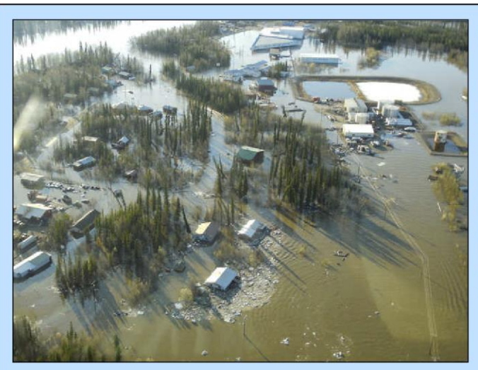
Figure 5: River Flooding in Galena, Alaska