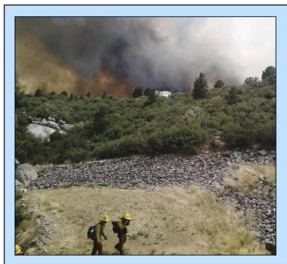
Figure 6: Wildfire along a Mountainous Ridge near Yarnell, Arizona

Arizona emergency management officials told us they were not clear about the degree of technical support FEMA would provide under the NDRF following a disaster. As shown in figure 6, a 2013 wildfire near the unincorporated town of Yarnell resulted in significant damage to the town's only water system.