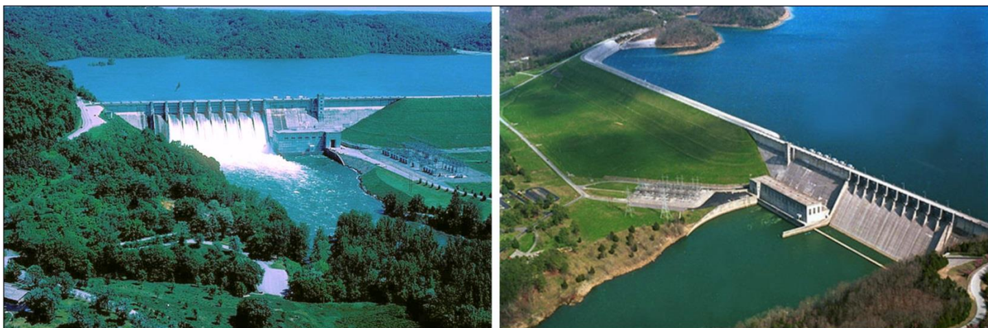
Figure 2: Center Hill, TN, (left) and Wolf Creek, KY, Dams

GAO-16-106