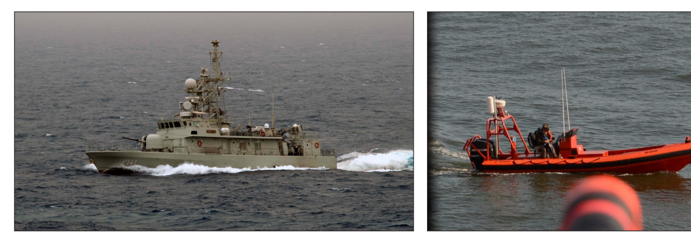
Fast attack craft (FAC) Source: Defense Video and Image Distribution Service. | GAO-16-201