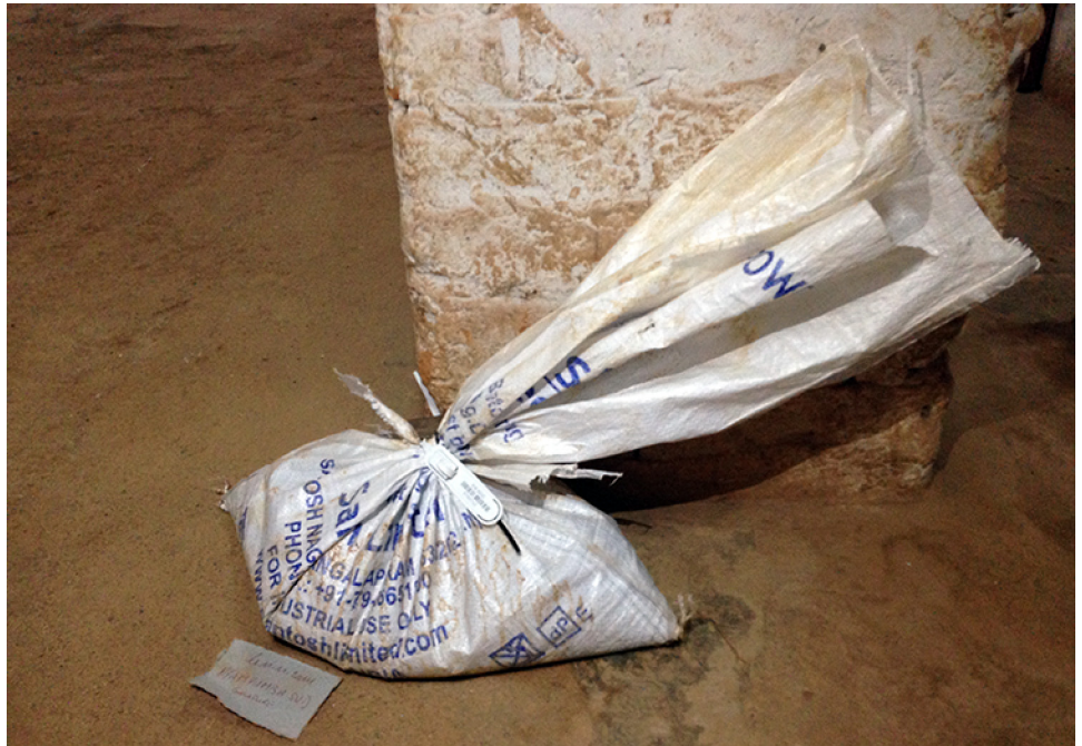
Figure 2: A Bag of Tin Ore Tagged for Export at a Mine in Rwanda