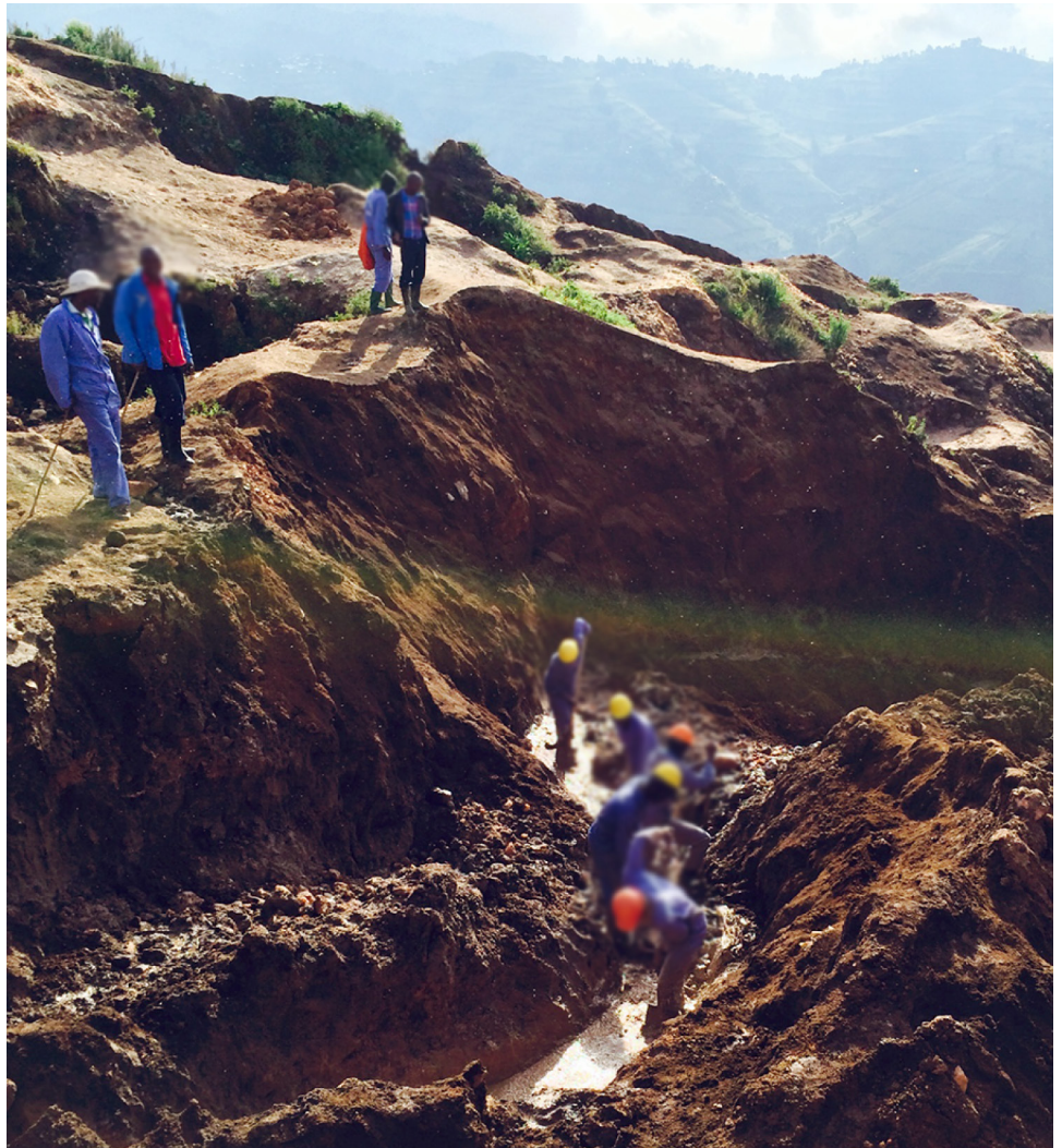
Figure 3: Artisanal Miners at a Tantalum Mine in the Democratic Republic of the Congo