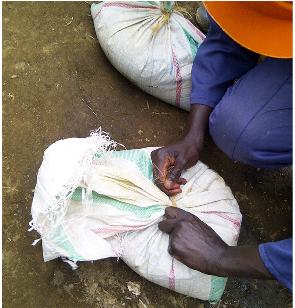
Figure 1: A Bag of Tantalum Ore Being Prepared for Tagging (a Method to Trace Origin) and Export at a Mine in the Democratic Republic of the Congo

We took the following photographs in the Democratic Republic of the Congo, Burundi, and Rwanda during fieldwork for our August 2015 report.