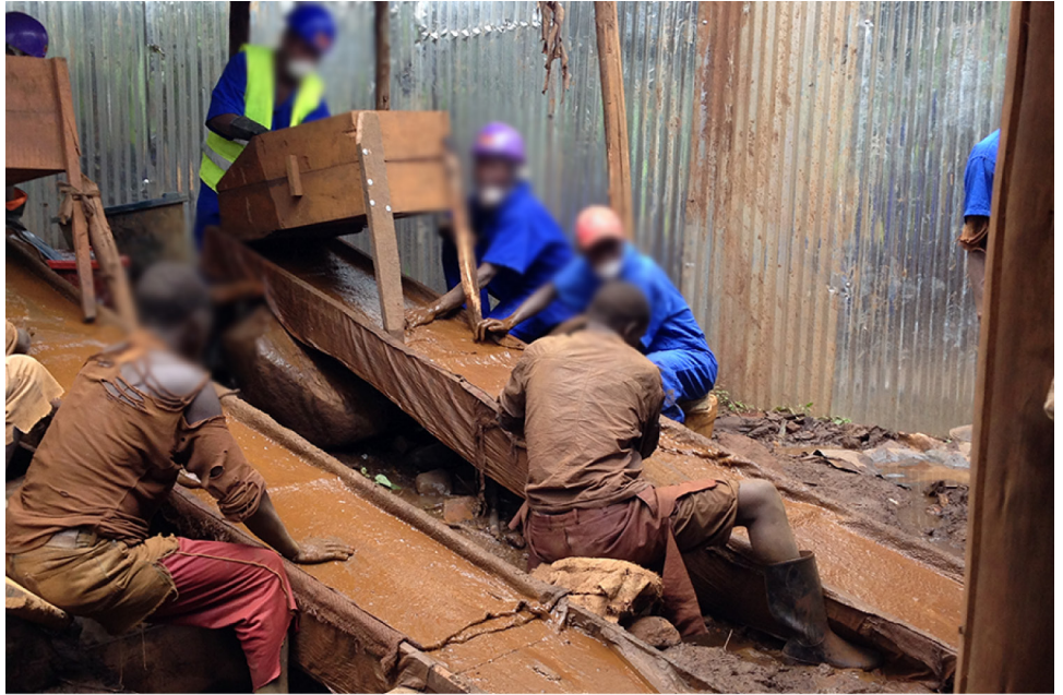
Figure 4: Artisanal Miners at a Gold Mine in Burundi