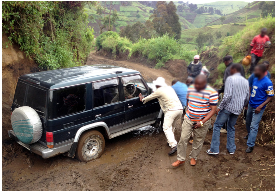
Figure 5: Stuck Vehicle during a Visit by GAO Team to a Mine Site in the Eastern Part of the Democratic Republic of the Congo, November 2014