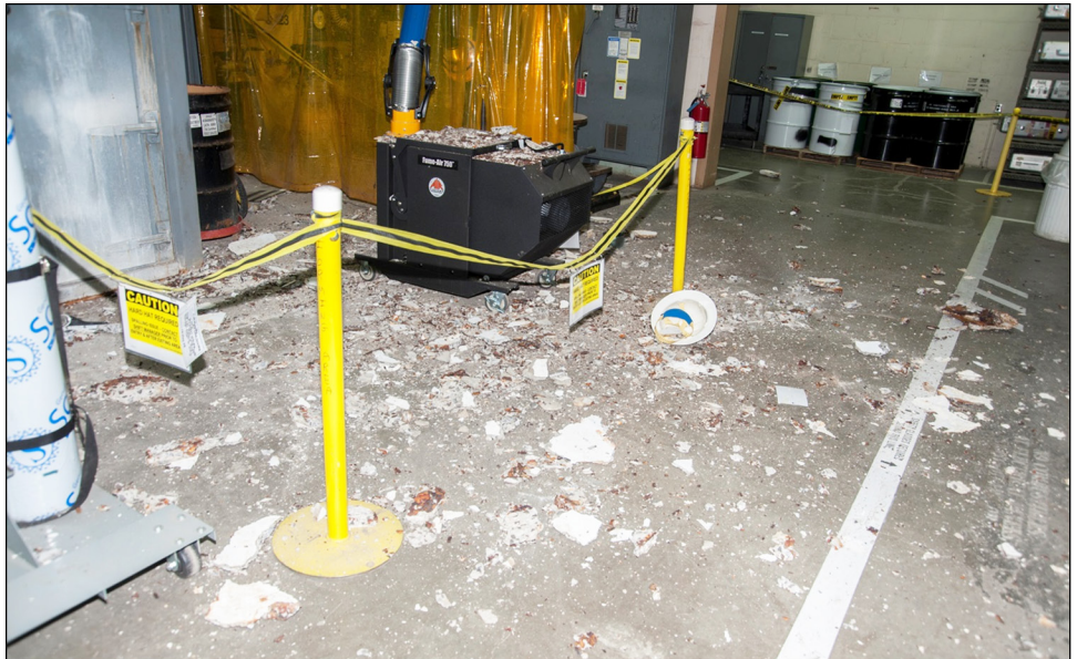
Figure 4: Building 9204-2 at Y-12 Where a 300-Pound Slab of Concrete from the Ceiling Collapsed in March 2014

GAO-15-525