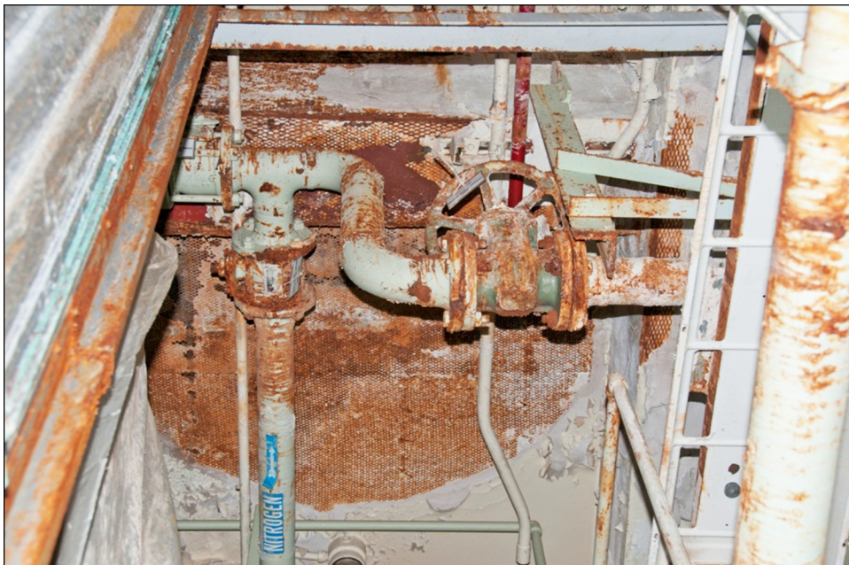
Figure 3: Corroded Equipment in Building 9204-2

Source: National Nuclear Security Administration. | GAO-15-525