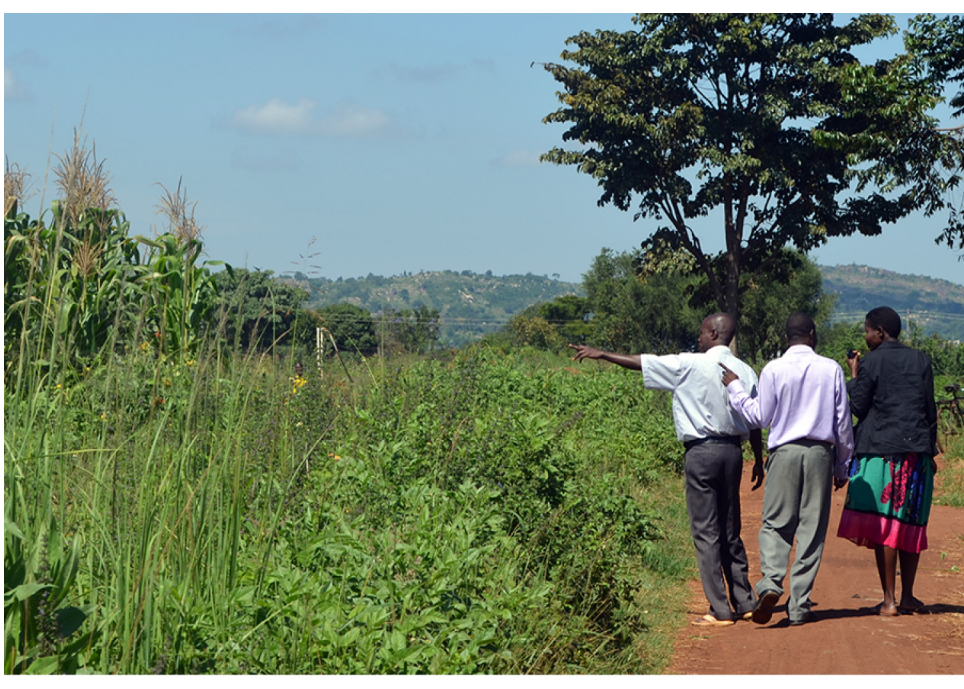
Figure 1: F2F Beneficiaries Touring a Field Where Maize Is Being Cultivated

Congress first authorized the F2F program in the 1985 Farm Bill to provide for the transfer of knowledge and expertise of U.S. agricultural producers and businesses to middle-income countries and emerging democracies on a voluntary basis. Most recently, Congress reauthorized the program in the 2014 Farm Bill. Congress has authorized the F2F program to provide a broad range of U.S. agricultural expertise using U.S volunteers. The 2- to 4-week volunteer assignments are designed, among other things, to improve farm and agribusiness operations and agricultural systems, field crop cultivation, fruit and vegetable growing, livestock operations, marketing, and the strengthening of cooperatives and other farmer organizations (see fig. 1).