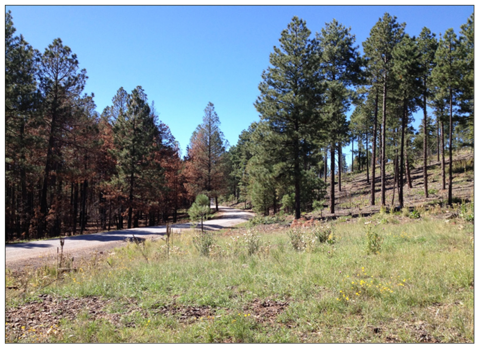
Figure 3: The Effect of Tree Thinning on Wildfire Containment in Arizona

The picture on the left shows the forest condition before thinning of smaller diameter trees. The picture on the right shows the forest condition after thinning, which, according to project managers, is the desired condition for this type of forest.