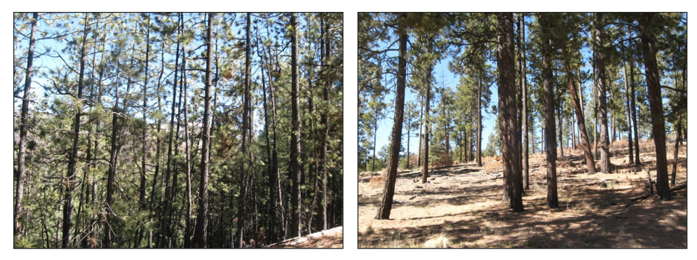
Figure 2: Forest Condition Before and After Thinning in New Mexico