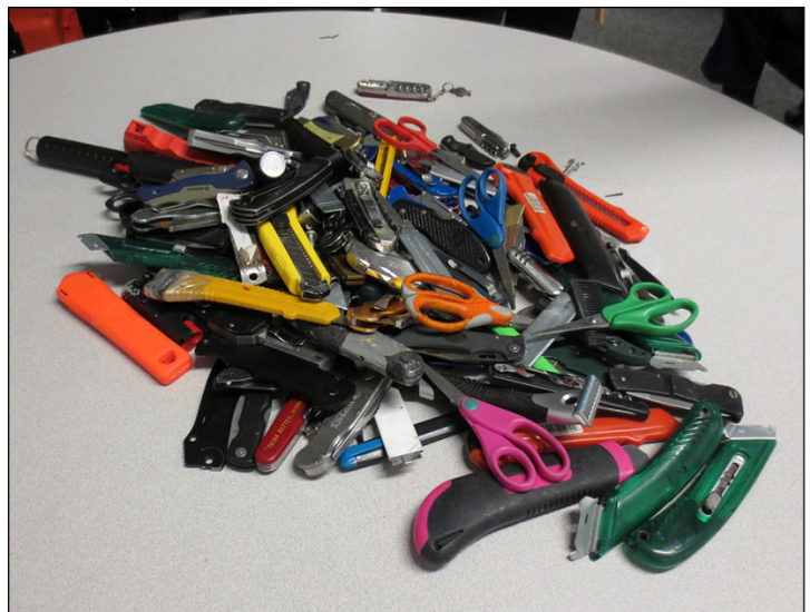
Figure 8: Prohibited Items Confiscated at a Building We Visited

Furthermore, for the larger building mentioned above, we identified 5 years (fiscal years 2009 through 2013) where no prohibited items were reported by FPS. However, during our visit to the building, FPS officials stated that prohibited items had been identified during that time period and provided physical evidence of prohibited items recently collected at the building (see fig. 8 below). According to FPS headquarters officials, in 2009, the prohibited items policy at the building—set by the facility security committee, not FPS—was for protective security officers to turn away anyone attempting to enter the building with a prohibited item. As a result, the protective security officers did not report identified prohibited items, believing that the policy was to report only items that had been confiscated. FPS headquarters officials stated that they had not been aware that there was a misinterpretation of the policy and that this resulted in a 5-year lapse in FPS oversight.