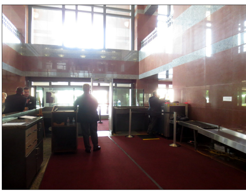
Figure 1: Glare Affecting Screening of the Public at a Building We Visited