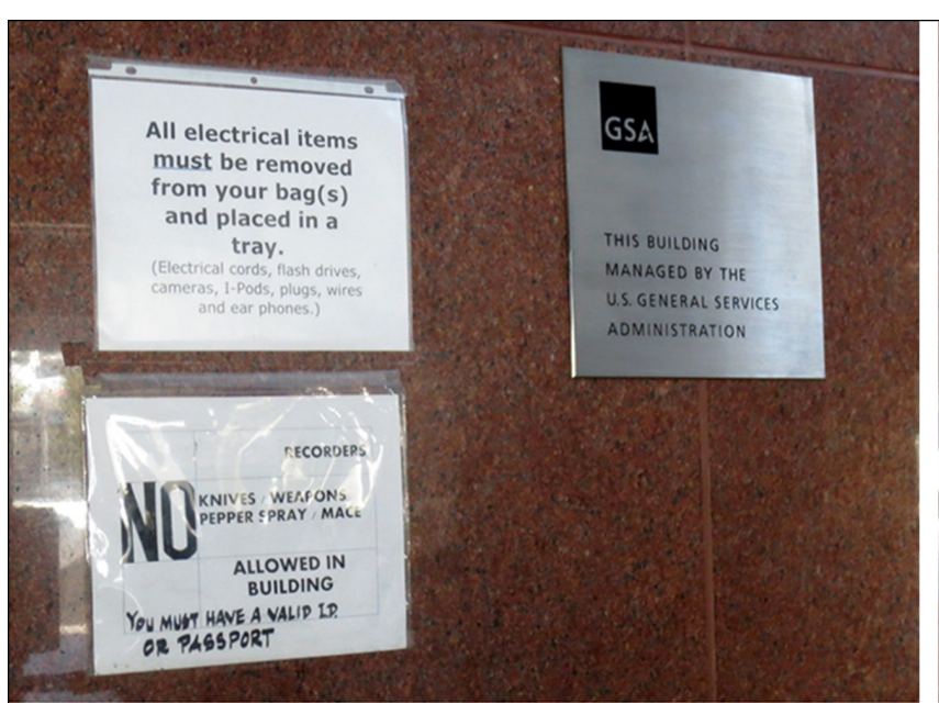
Figure 6: Signs Directing Visitors through the Security-Screening Process at a Building We Visited