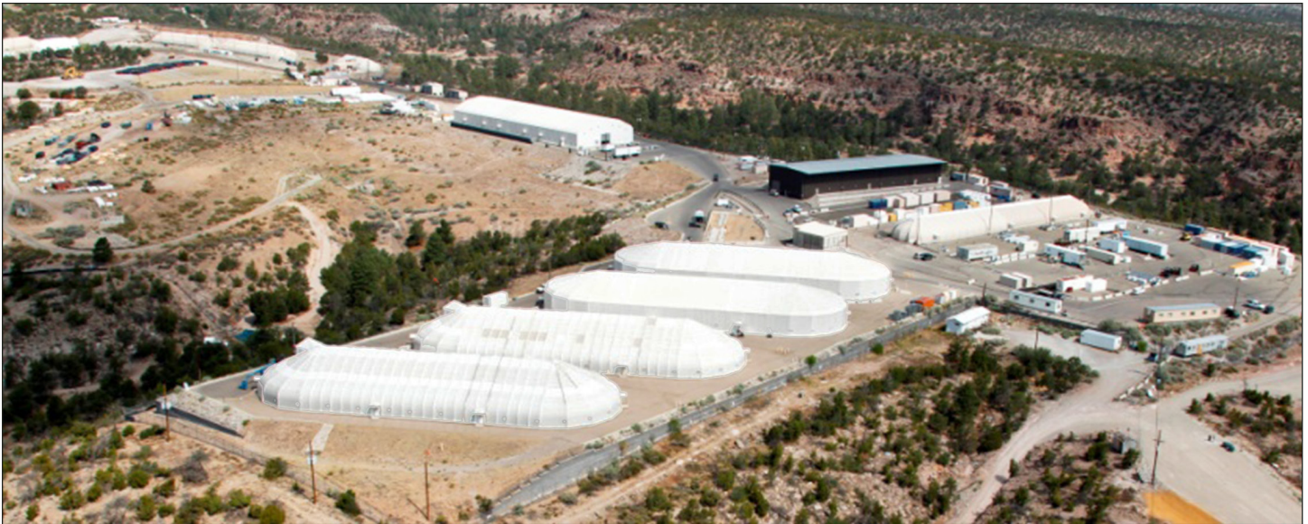
Figure 1: Aerial View of Area G at Los Alamos National Laboratory

Source: Los Alamos National Laboratory. | GAO-15-182