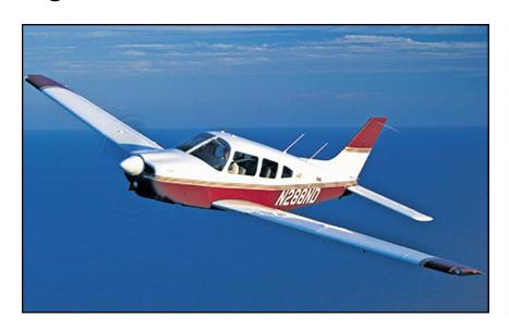
Figure 1: The Federal Aviation Administration Issues Certificates for a Variety of U.S. Aviation Products