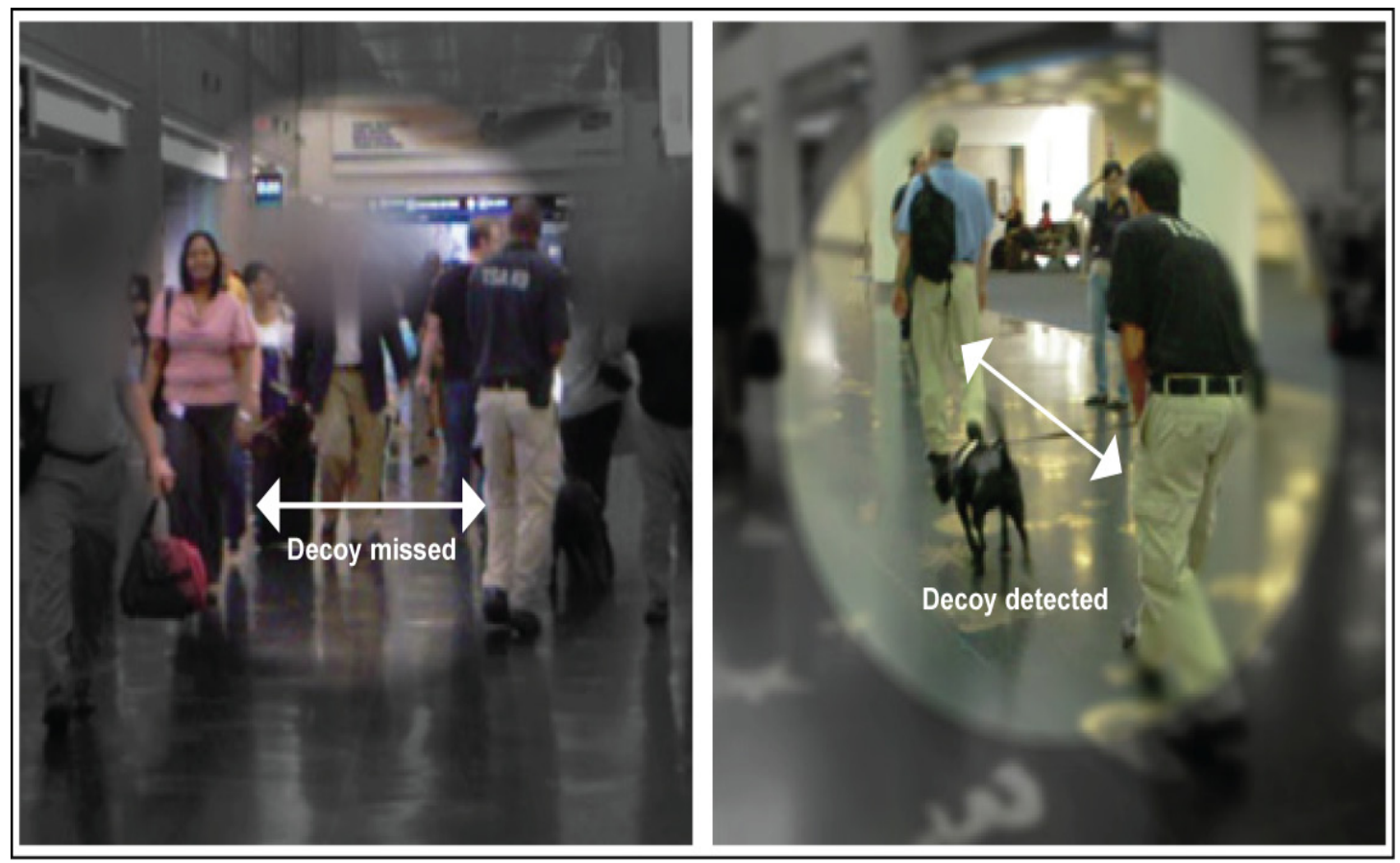
Figure 2: Video Stills Showing Passenger Screening Canine (PSC) Teams Training in Airport Terminal, June 2012