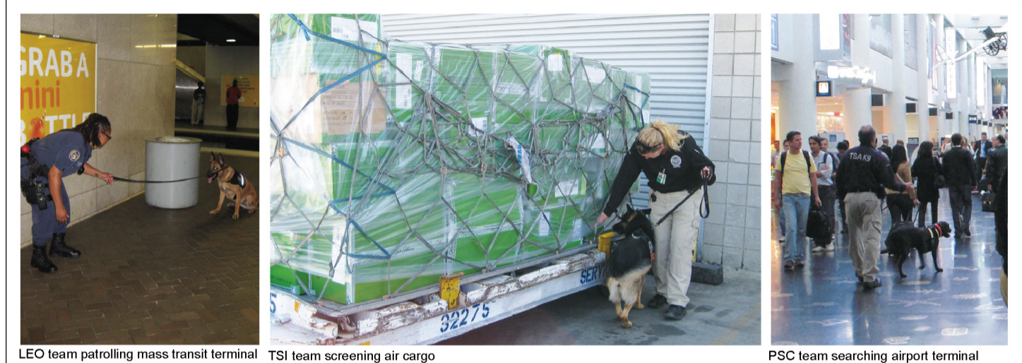
Figure 1: Various Types of Canine Teams

LEO team patrolling mass transit terminal TSI team screening air cargo