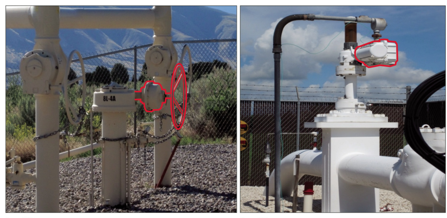
Figure 3: A Hand Wheel Used to Close a Manual Valve (Outlined in Red on Left) and an Actuator Used to Remotely Close an Automated Valve (Outlined in Red on Right)