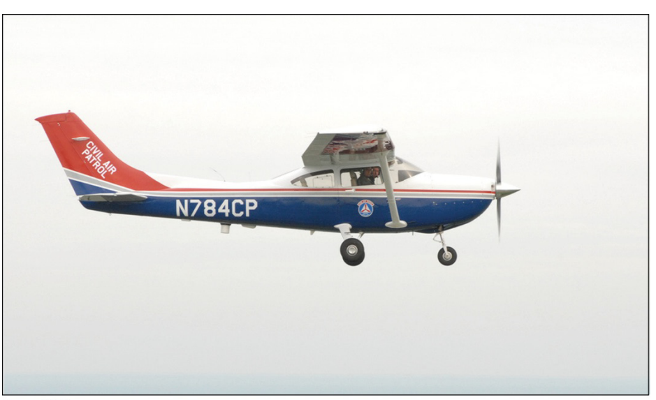
Figure 1: CAP Cessna 182