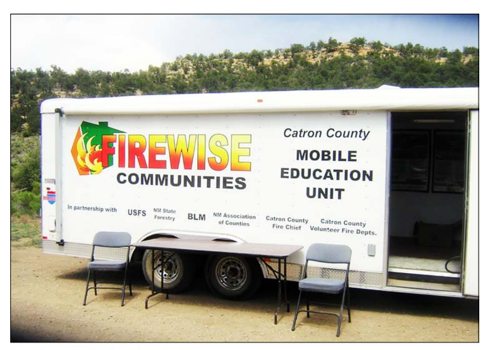
Figure 1: Mobile Firewise Trailer Used to Educate Residents on Firewise Principles