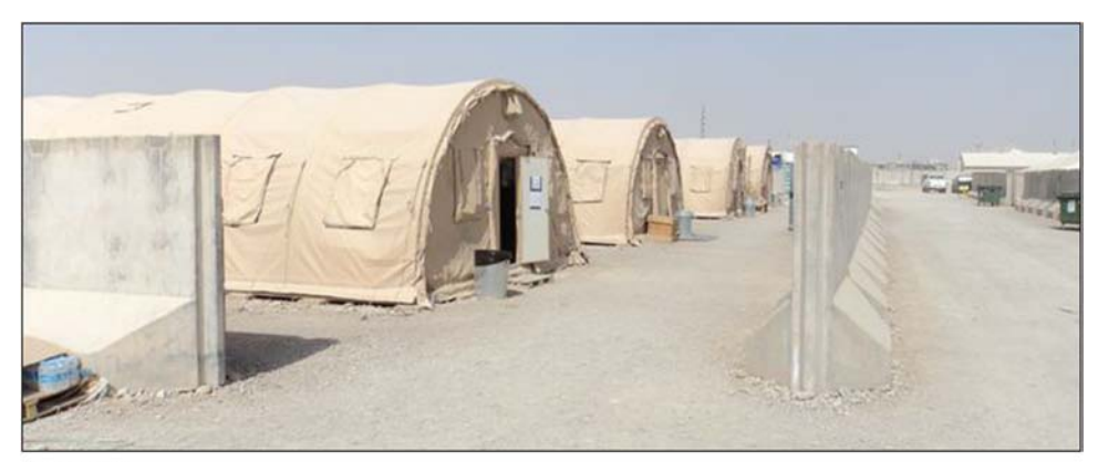
Figure 4: Expeditionary Living Facilities at Camp Leatherneck without DODrecommended Solar Shading