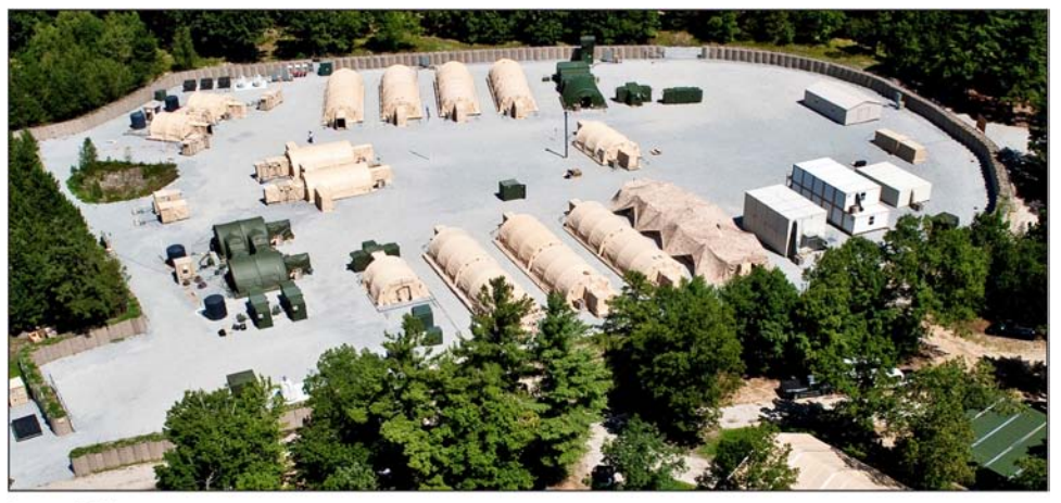
Figure 8: Aerial shot of the Base Camp Integration Laboratory at Fort Devens, MA