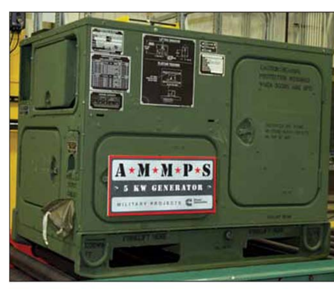
Figure 6: Advanced Medium Mobile Power Source (AMMPS)