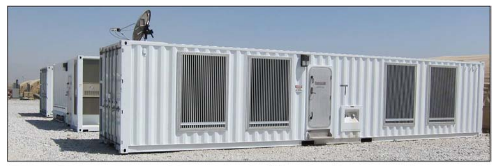
Figure 7: 1-megawatt Microgrid at Bagram Airfield