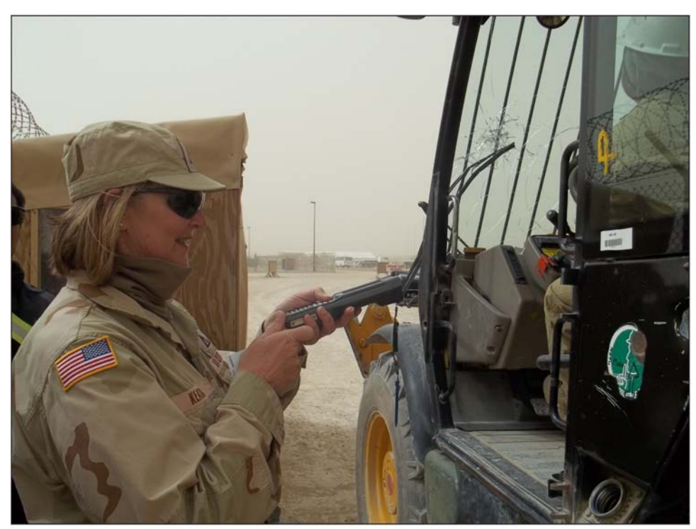
Figure 9: Tactical Fuels Manager Defense System