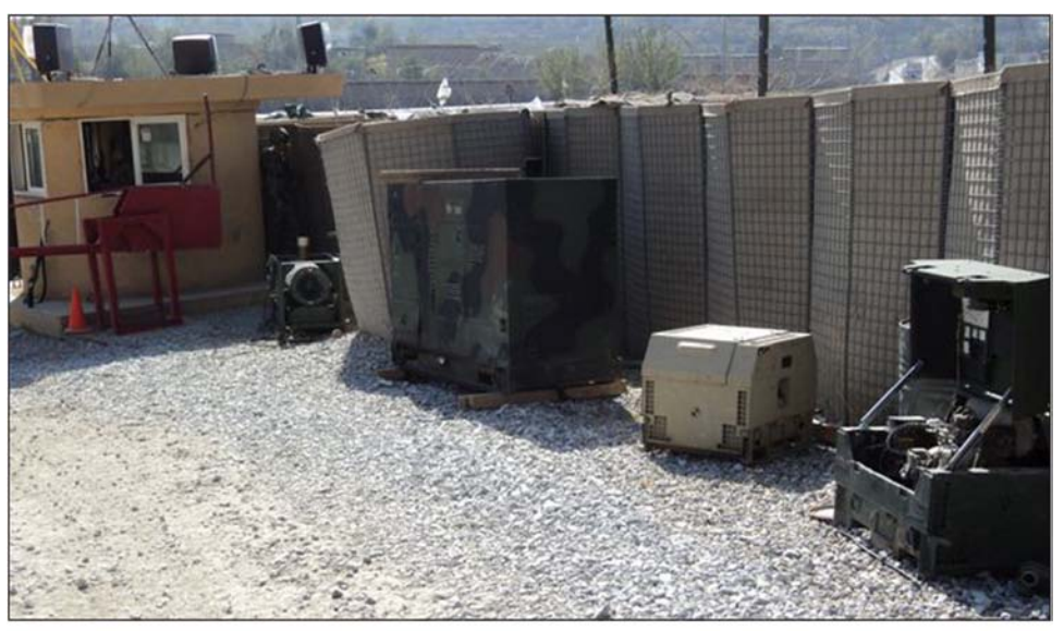
Figure 5: Entry Control Point at Joint Combat Outpost Pul-A-Sayed Using a More Powerful than Necessary 60-kilowatt Generator